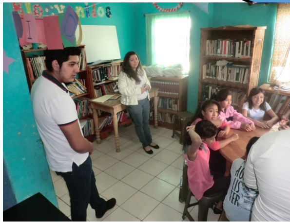
Students in our library class room. Prior to the Pandemic

Your purchase of our Family Coffee supports our efforts in Guatemala City