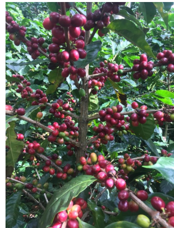
Coffee cherries (berries) ready for the harvest.

You can purchase our premium Honduras Coffee on our website.