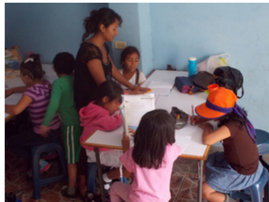
A tutoring group of students

You can purchase our family coffee at: fathertomsfamilycoffee.com