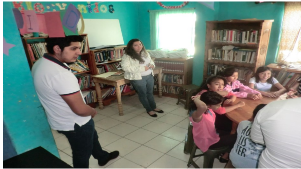
Students in our library class room. Prior to the

Post Office Box 1583 New Caney, Texas, 77357